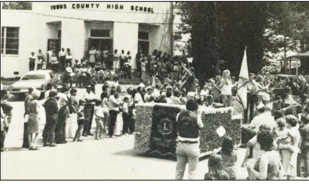
A classic photograph, taken straight out of time, capturing a past Georgia Mountain Fair for the parade.